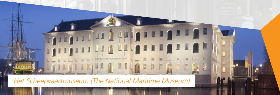
Het Scheepvaartmuseum (The National Maritime Museum)